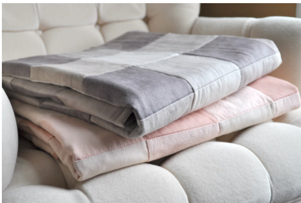
Gingham for Giants, two sweet crib quilts.

For my naturally dyed, organic cotton fabrics & quilting and sewing patterns: www.tierneybarden.com